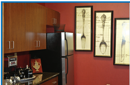
The Medical Center League House has a community kitchen with coffee pots, a refrigerator, and microwave.