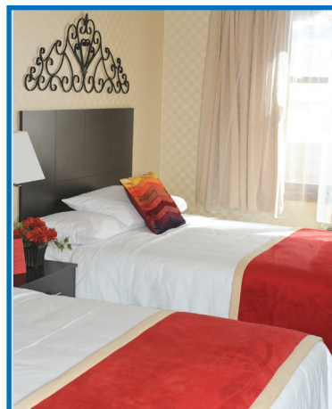
The photo above features one of the rooms guests can stay in with two queen beds.

Like many other businesses, the League House has been required to make accommodations to continue operation during the COVID-19 pandemic. Glawe stated that they have taken many precautions to protect the employees and guests of the facility by tightening their policies and procedures. They are disinfecting all public spaces and surfaces such as doorknobs, counters, etc. Hand sanitizer is located throughout the building for all to use. Employees are being required to wash their hands when coming into work and frequently throughout the day. Before patrons are allowed entry into the building, they will be triaged. Employees will ask guests if they are experiencing any symptoms of the virus, have their temperature taken, and will be required to wear masks in public areas. Once in private areas, such as rooms, guests are not required to wear masks. If the guests have been in close contact with someone who has the virus, or has been hospitalized for the virus, they will not be given the ability to stay at the League