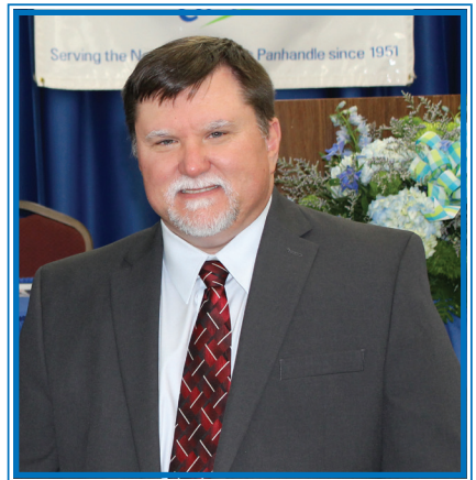
New XIT Rural Telephone General Manager