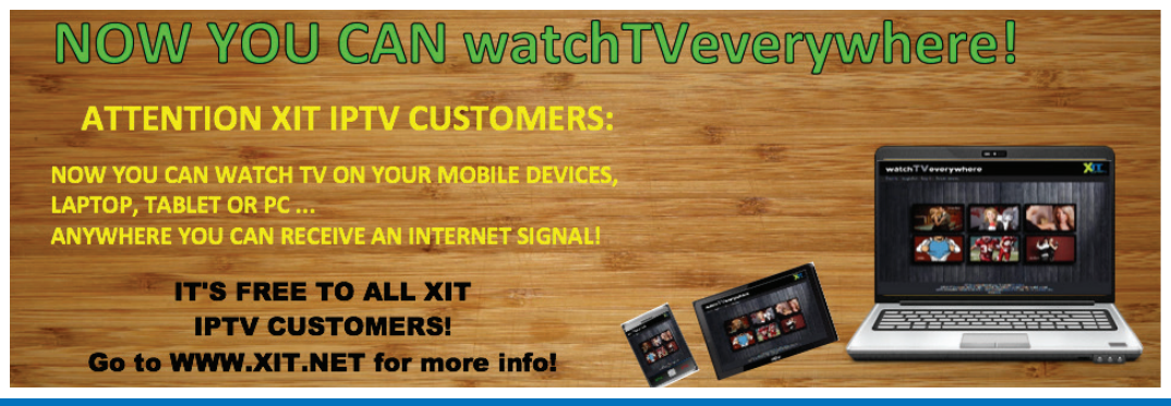
Serving the Northwest Texas Panhandle Since 1951

Keep in mind that even if your photograph does not make the cover of our next directory, we may use it on one of our quarterly newsletter covers. So, keep those cameras snapping and be sure to submit your photos to XIT! Good luck photographers!